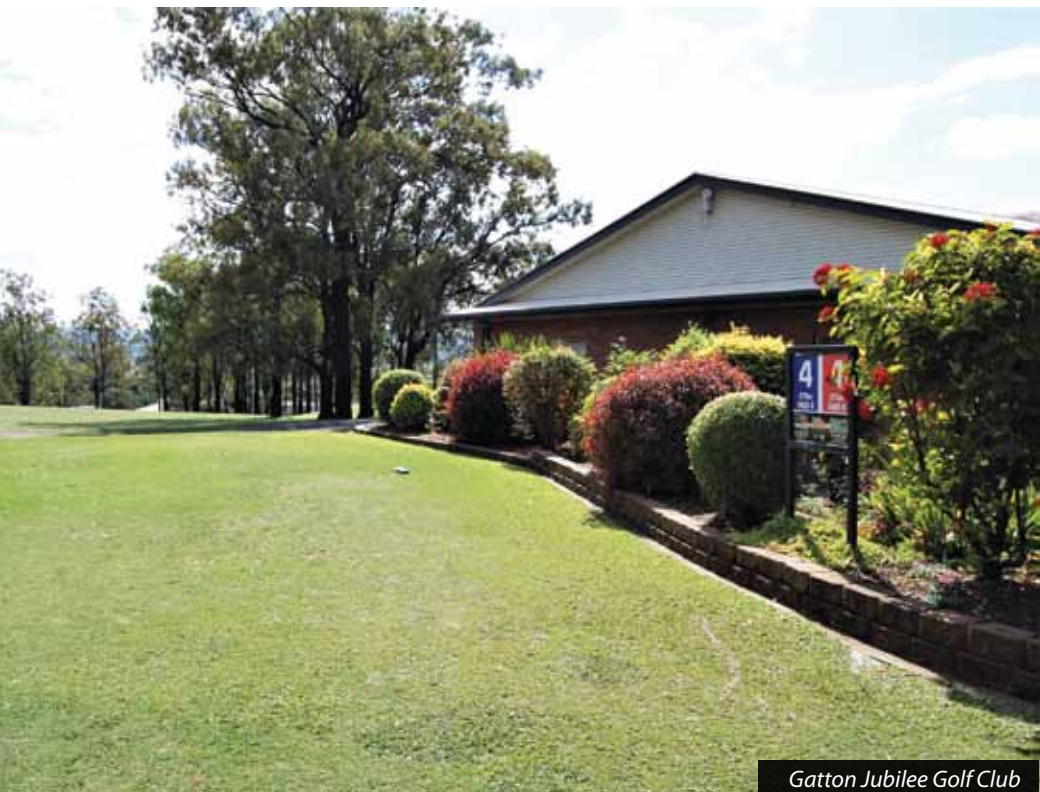
Gatton Jubilee Golf Club