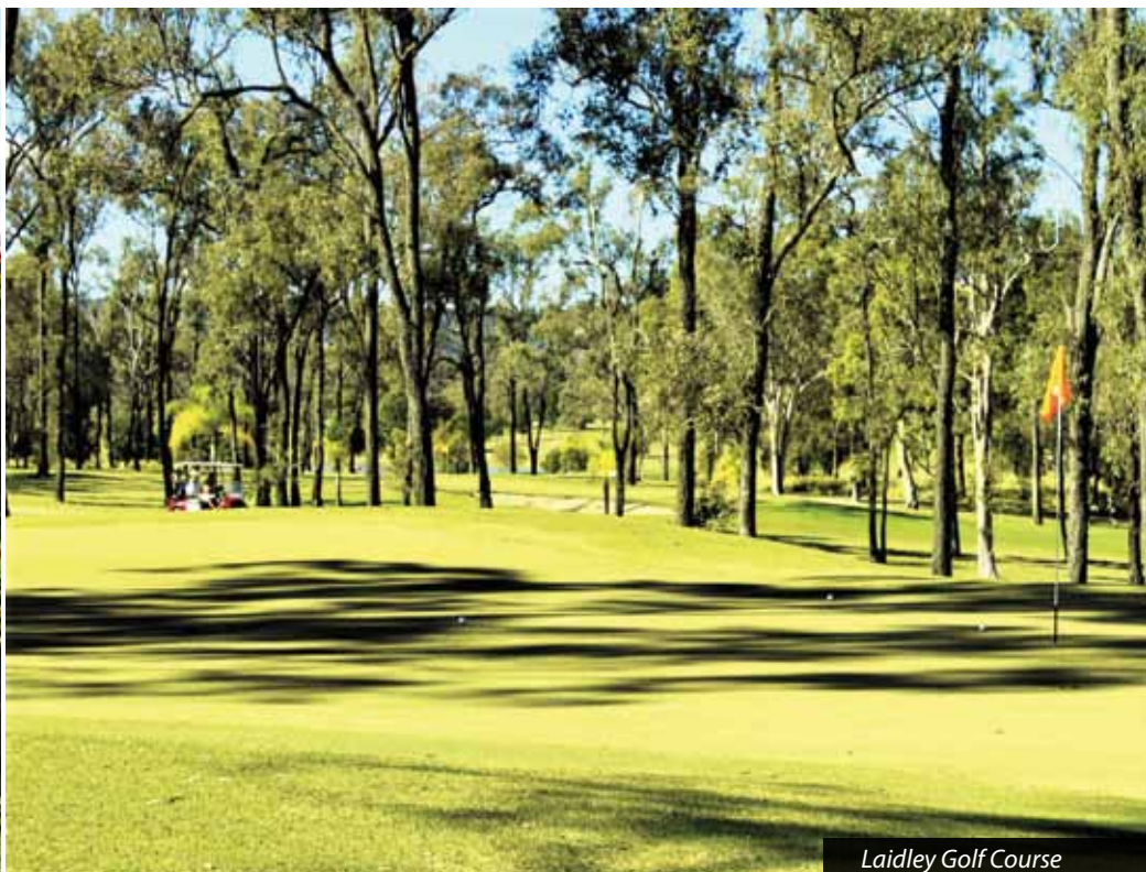
Laidley Golf Course

THE Gatton Jubilee Golf Club is the Lockyer Valleys favourite leisure venue.