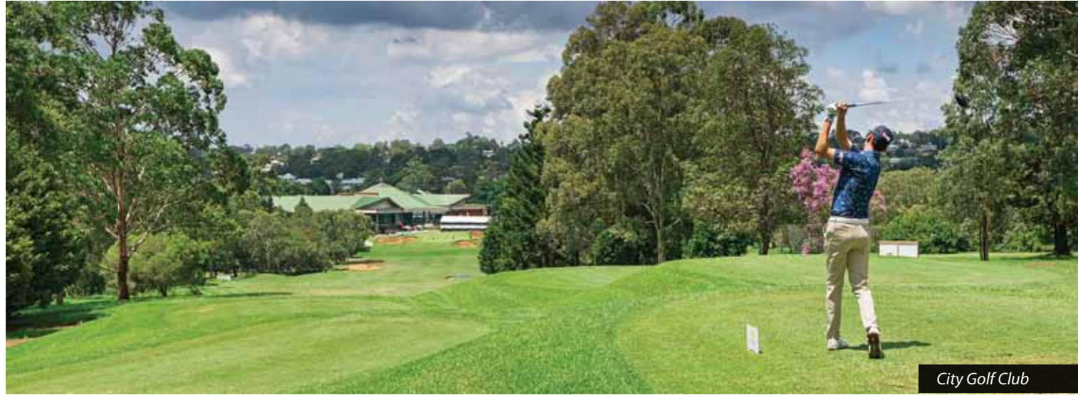
City Golf Club

After the relatively flat opening nine you drive skyward to the back nine where there are holes with big elevation changes.