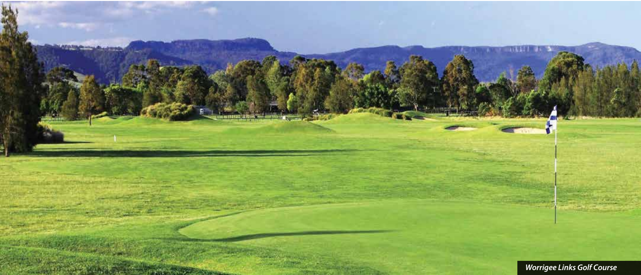
Worrige Links Golf Course