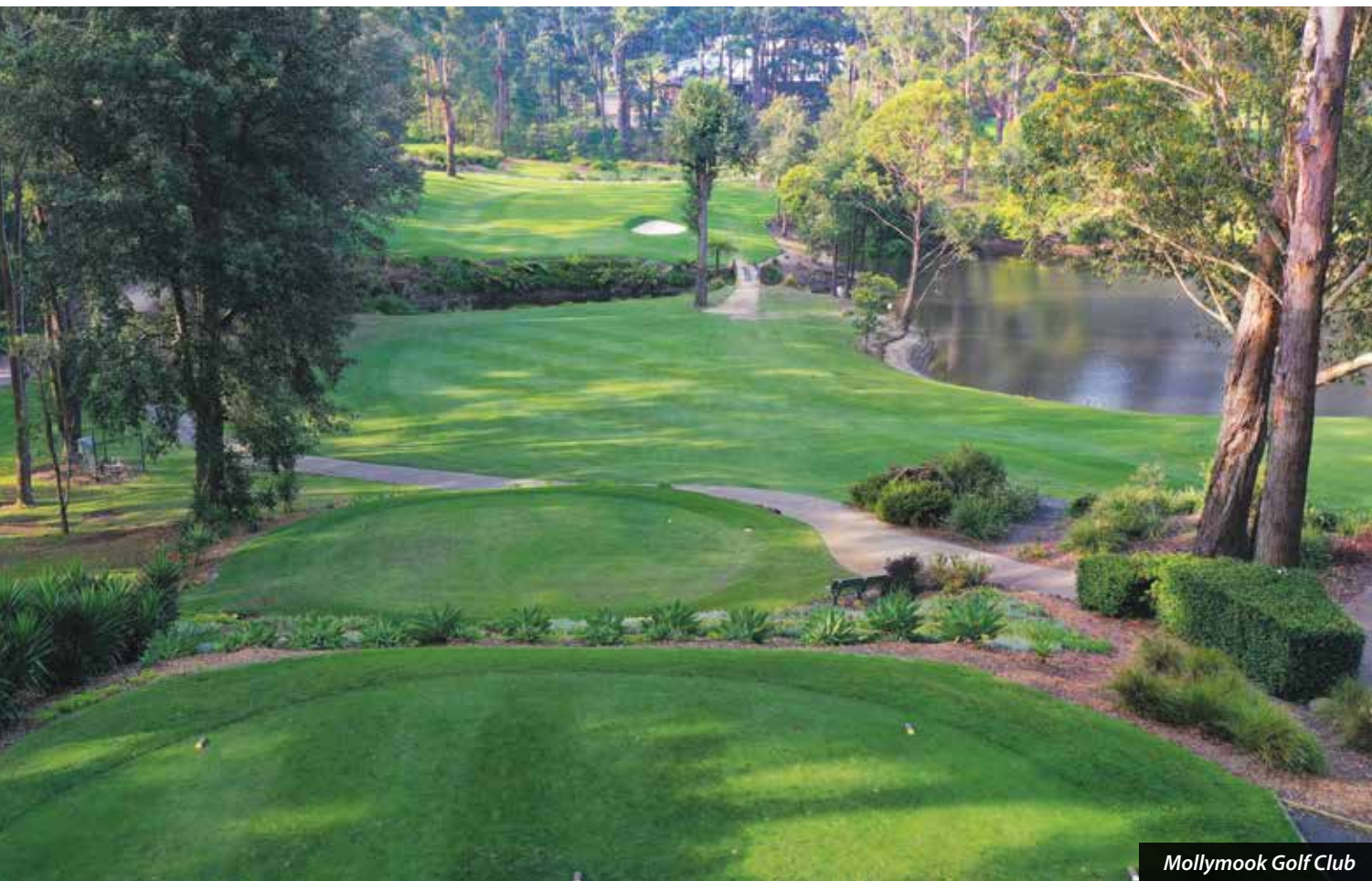
Mollymook Golf Club