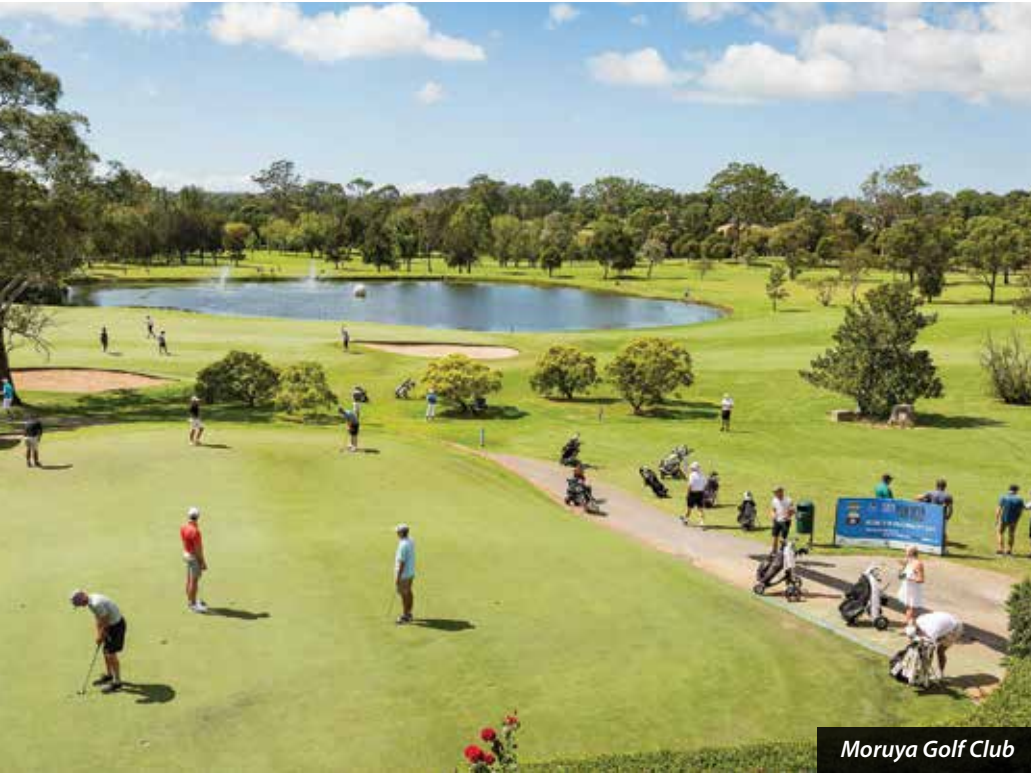
Moruya Golf Club