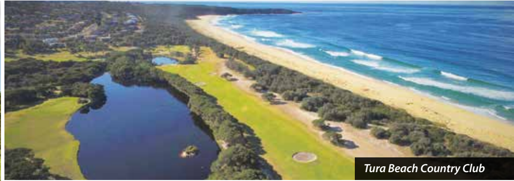
Tura Beach Country Club

Moruya Golf Club Evans Street, Moruya, NSW 2537 Phone: (02) 4474 2300 www.moruyagolfclub.com.au