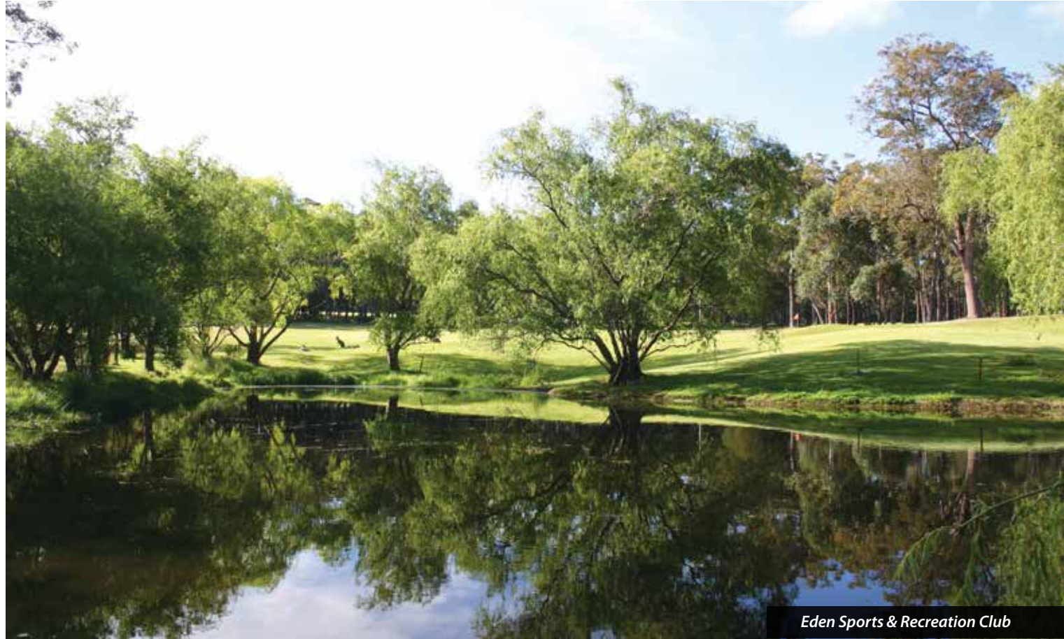
Eden Sports & Recreation Club

Bowling days at Eden Sports and Recreation are Tuesday for Social Bowls play at 10am, Thursday Social Bowls play at 1pm and Sunday Social Bowls play at 11am.