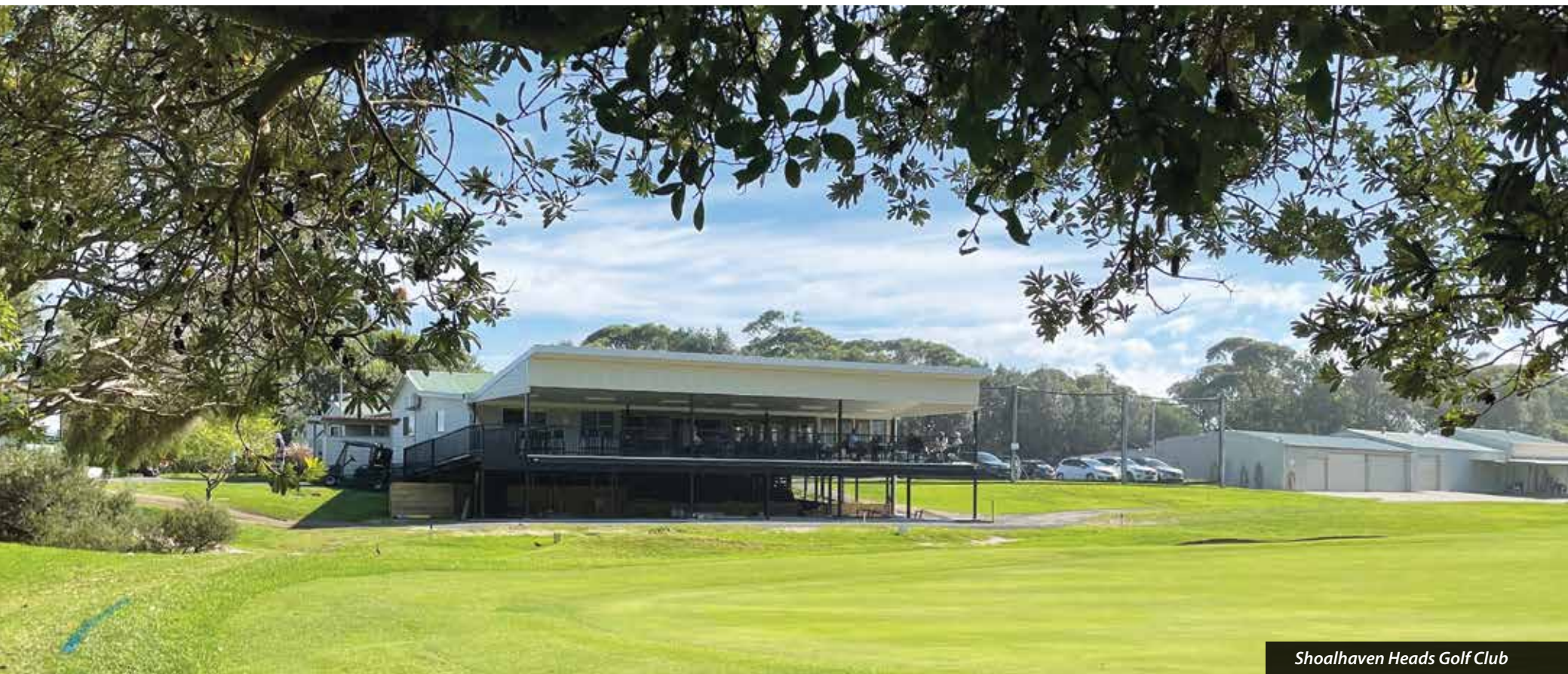
Shoalhaven Heads Golf Club