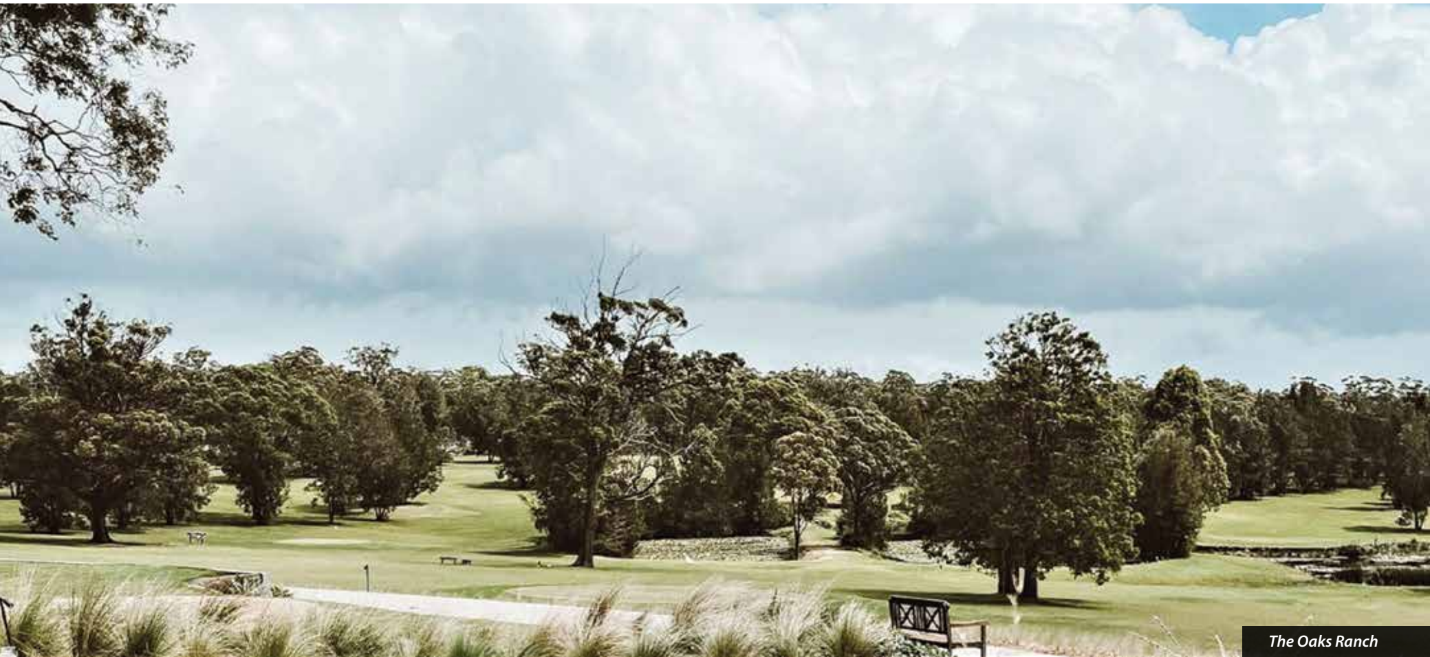
The Oaks Ranch