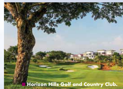
■ Horizon Hills Golf and Country Club.

Also certainly worth a game, two more quality golf courses in the region, the Penang Golf Resort , a newly established 36-hole facility which opened in 2019 and the Penang Golf Club , the only championship 18-hole golf course on Penang Island.