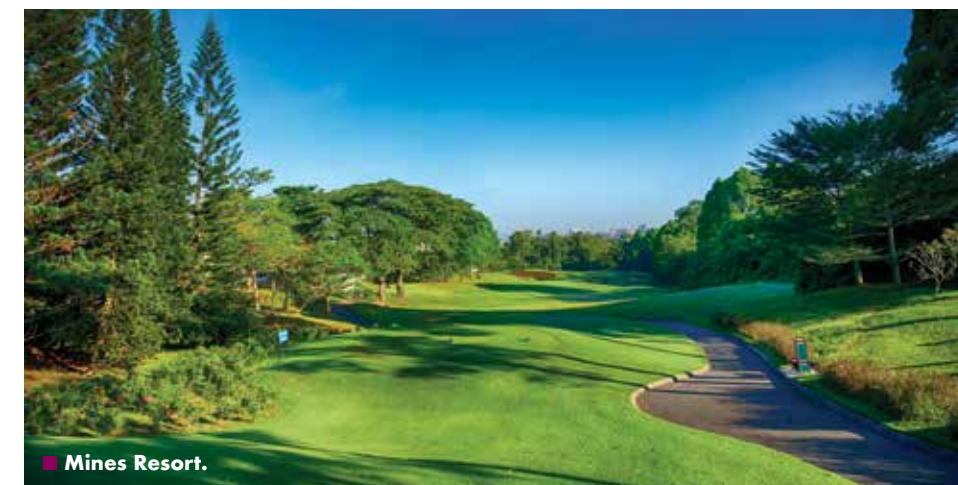
■ Mines Resort.

The Templer Park Country Club in Rawang, Selangor offers tranquil surroundings, where the Bukit Takun limestone hill juts out amidst the greenery, coupled with fountains spouting on the lake, adding to the relaxing atmosphere in providing an exceptional backdrop to the picturesque 18-hole golf course.