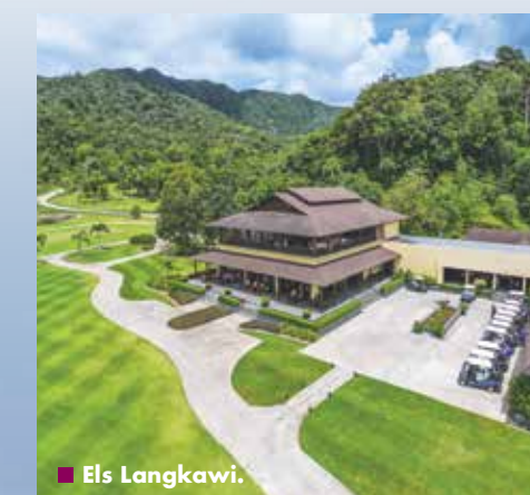
■ Els Langkawi.

For packages of more golfing information, go to www.malaysiagolfholiday.com