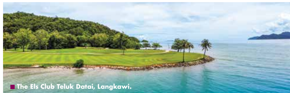
■ The Els Club Teluk Datai, Langkawi.

Coupled with welcoming people, great food and affordable golf, make a trip to Malaysia for a golfing experience which will be impossible to forget.