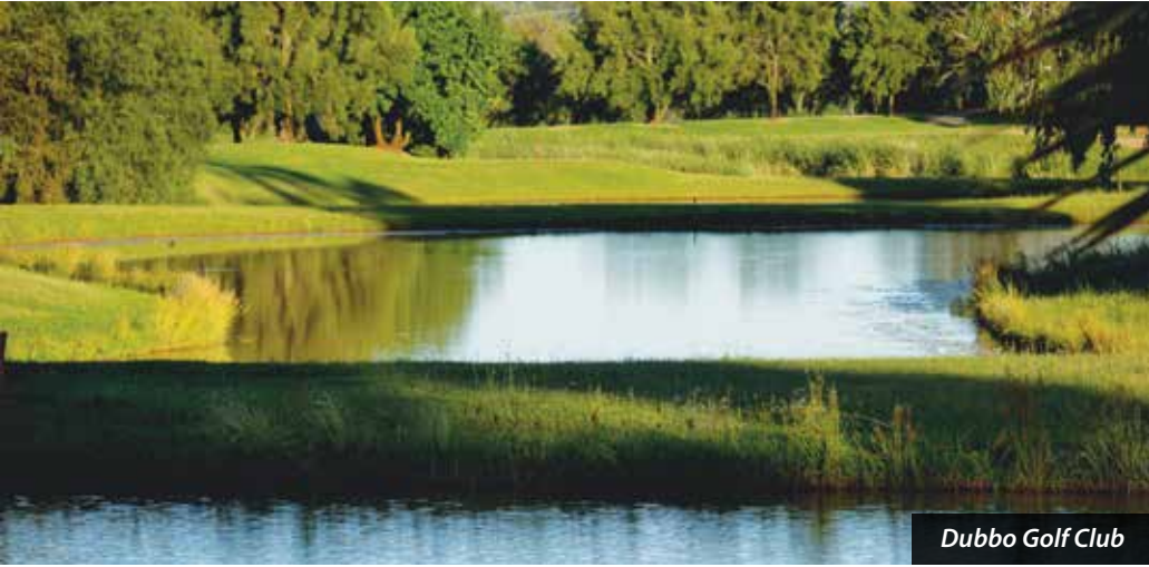
Dubbo Golf Club