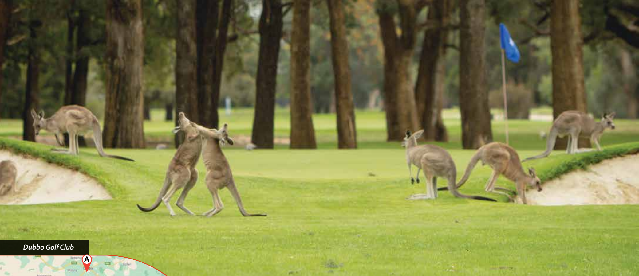
Dubbo Golf Club