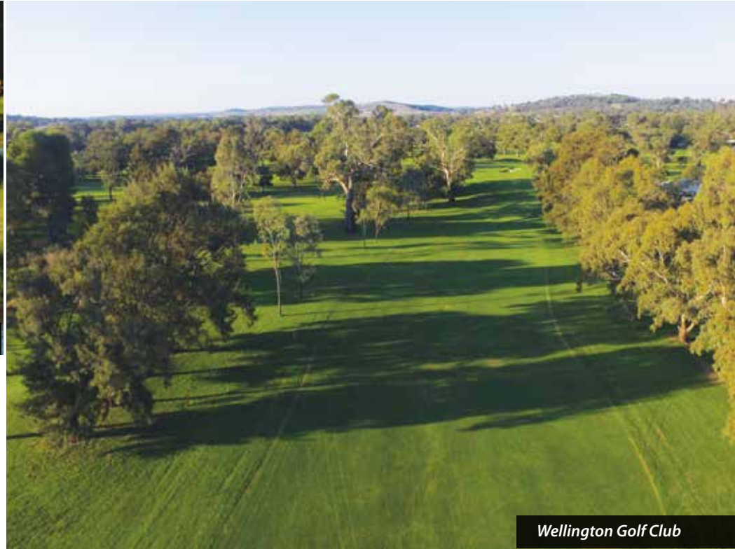
Wellington Golf Club

Dubbo Golf Club Newell Highway, Dubbo NSW 2830 Phone: (02) 6882 1255 admin@dubbogolfclub.com.au www.dubbogolfclub.com.au