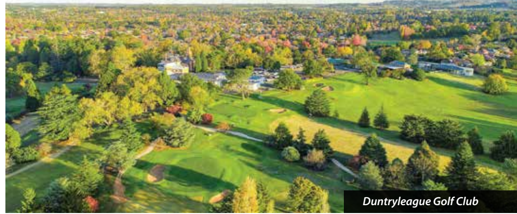
Duntryleague Golf Club