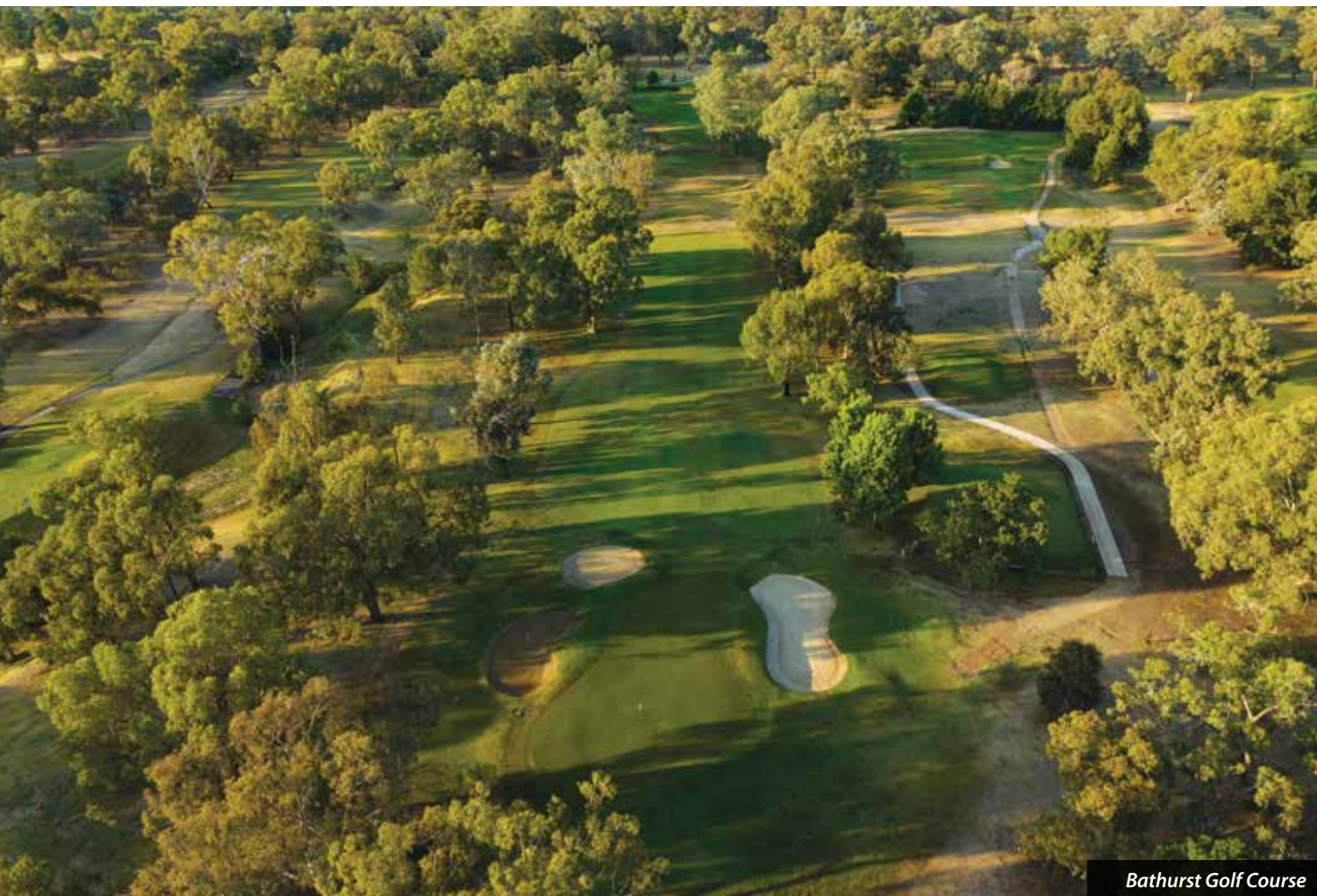
Bathurst Golf Course