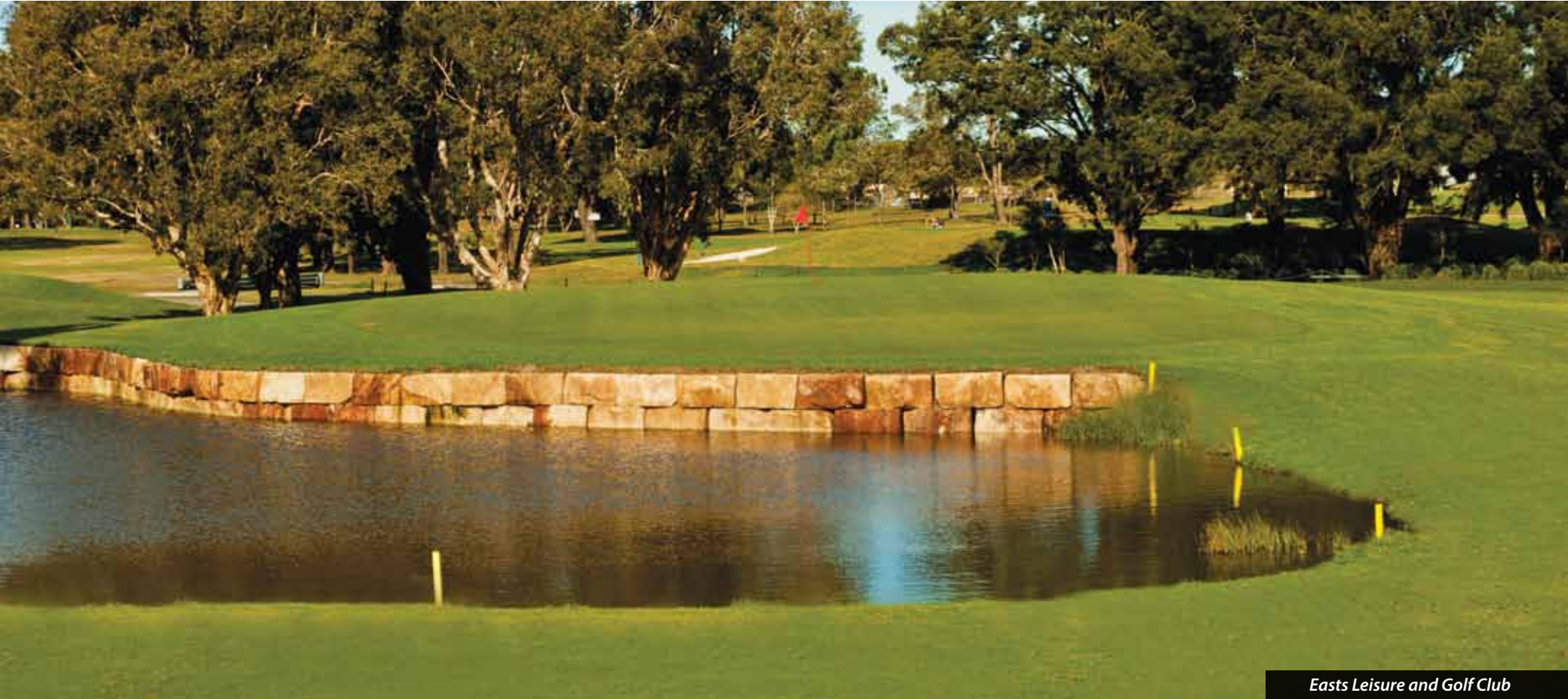
East's Leisure and Golf Club