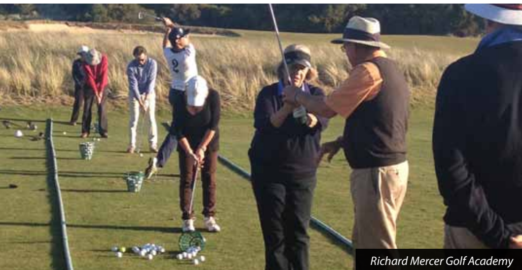
Richard Mercer Golf Academy