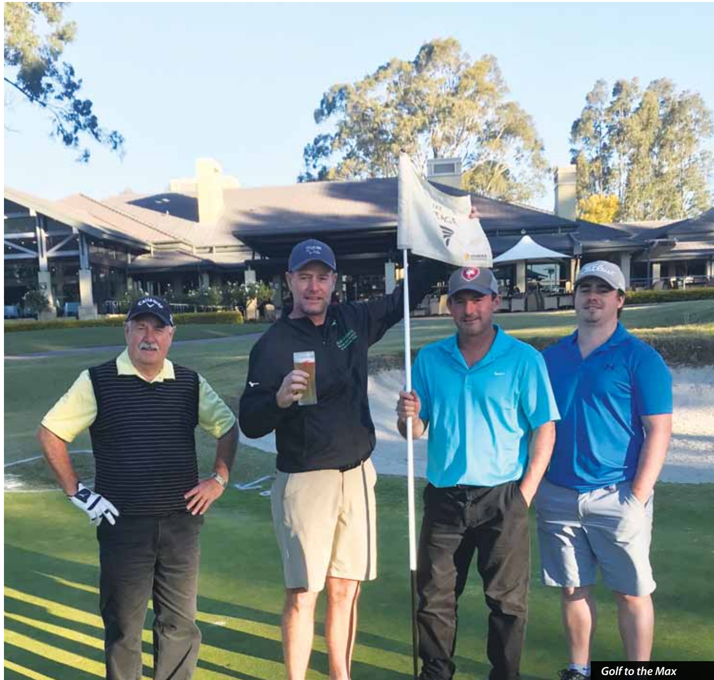
Golf to the Max

Would you like to see your club or course included in a future Inside Golf feature? Then have your General Manager or Marketing Manager contact us for details.